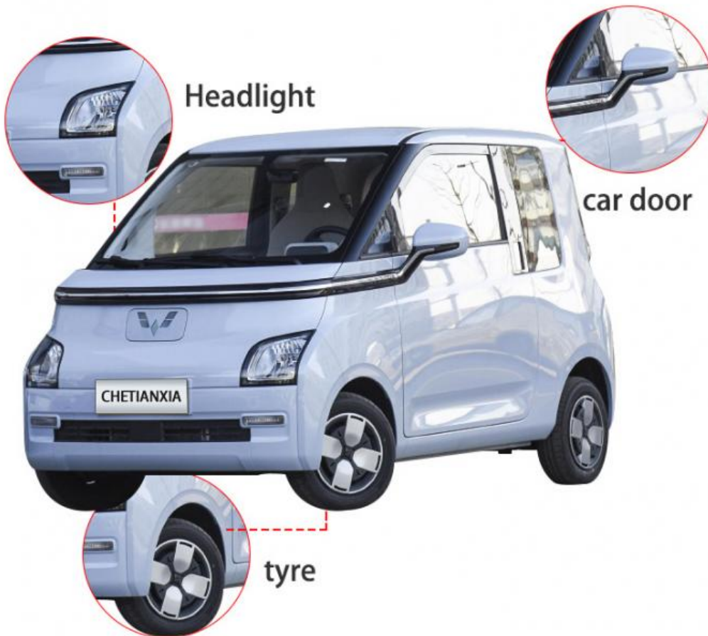
Wuling Air Ev