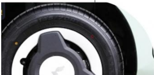
The picture of the steel wheel and wheel decorative cover is the 2021 Macaron Enjoyment Sanyuan Li