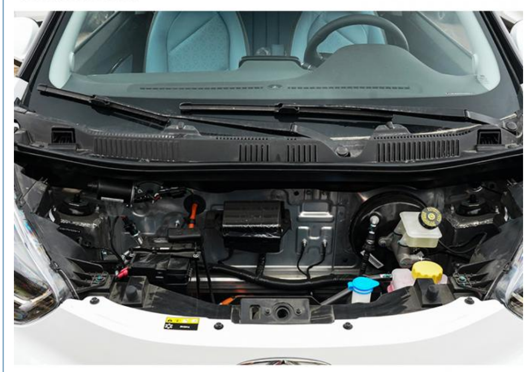
EV MINI get pure electric 41Ps horsepower motor drive, engine backup support, maximum speed of 100km/h, zero hundred acceleration time of 6s, electric energy equivalent fuel consumption of 1.1L/100km, good economic performance, which has a better effect on restraining the use cost