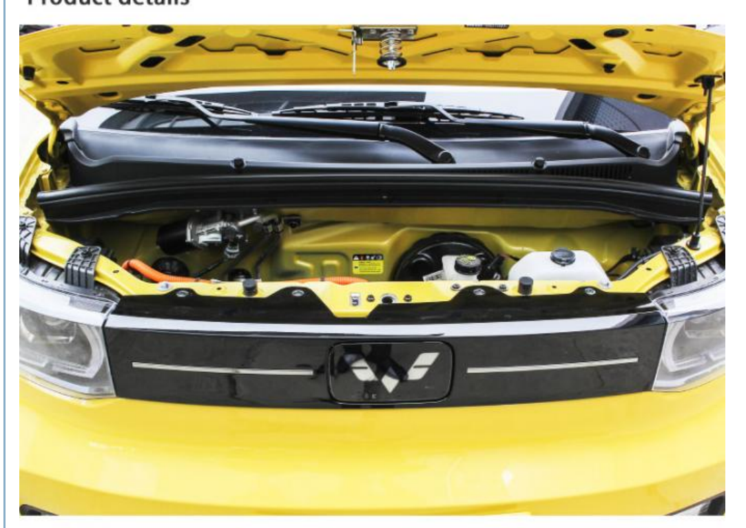
MINI EV get pure electric 27Ps horsepower motor drive, engine backup support, maximum speed of 100km/h, zero hundred acceleration time of 8.8s, electric energy equivalent fuel consumption of 1.1L/100km, good economic performance, which has a better effect on restraining the use cost