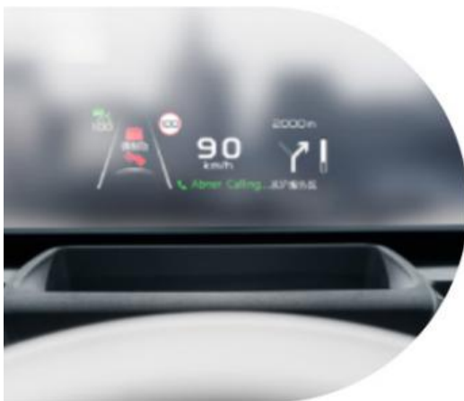
Interconnection with the central control large screen and instrument panel three screens

Breathable intelligent rhythm atmosphere light, can be switched freely, paired with music rhythm function