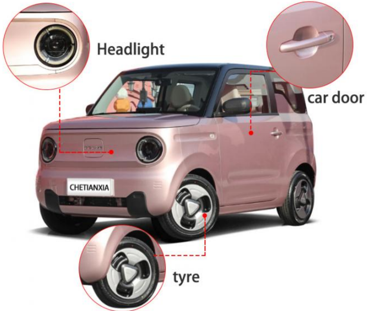
GEELY Panda Mini Ev Car