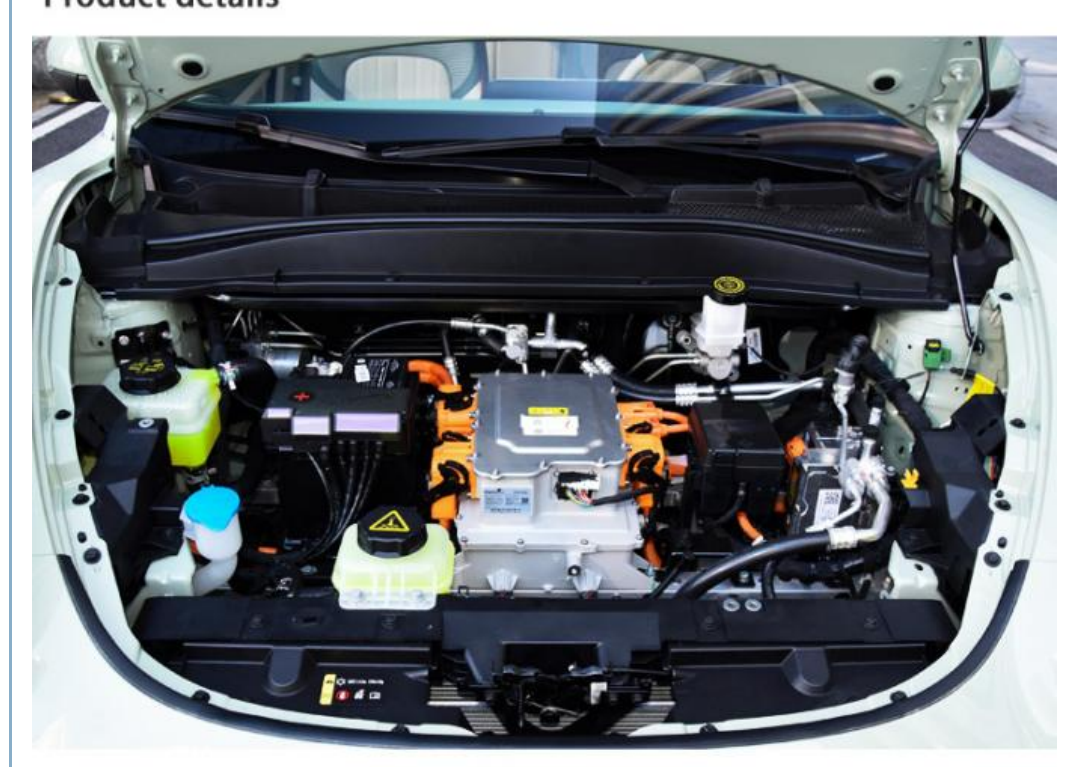
Euler's Good Cat get pure electric 210Ps horsepower motor drive, engine backup support, maximum speed of 150km/h, zero hundred acceleration time of 3.8s, electric energy equivalent fuel consumption of 1.56L/100km, good economic performance, which has a better effect on restraining the use cost