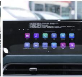
LCD and Reversing Image