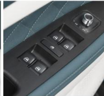
Tire Pressure Monitoring