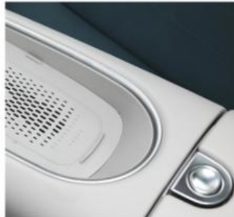
Switch Key Of Economic Mode And Sport Mode