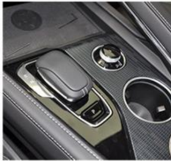
Switch Key Of Economic Mode And Sport Mode