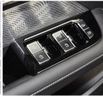
Tire Pressure Monitoring