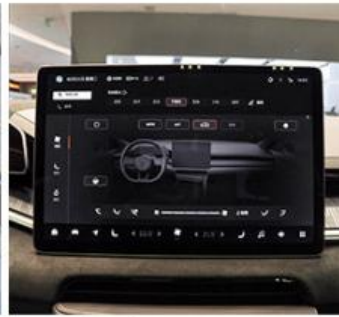
LCD and Reversing Image