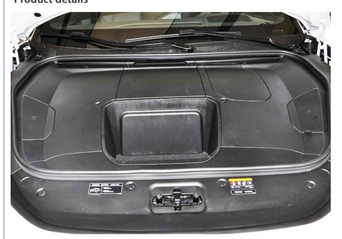
ZEEKR 001 get pure electric 544Ps horsepower motor drive, engine backup support, maximum speed of 200km/h, zero hundred acceleration time of 3.8s, electric energy equivalent fuel consumption of 1.85L/100km, good economic performance, which has a better effect on restraining the use cost