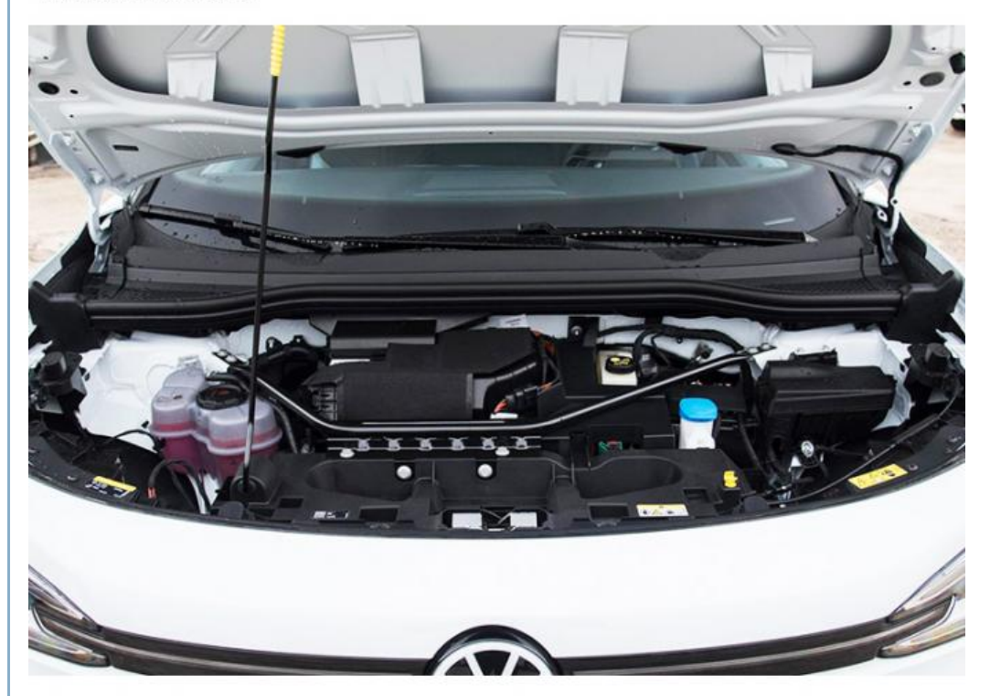
VW ID.4X get pure electric 204Ps horsepower motor drive, engine backup support, maximum speed of 160km/h, zero hundred acceleration time of 3.2s, electric energy equivalent fuel consumption of 1.65L/100km, good economic performance, which has a better effect on restraining the use cost