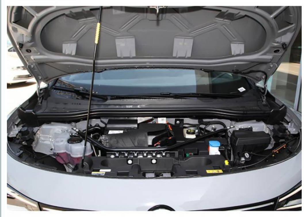
VW ID 4 Crozz get pure electric 204Ps horsepower motor drive, engine backup support, maximum speed of 160km/h, zero hundred acceleration time of 3.2s, electric energy equivalent fuel consumption of 1.62L/100km, good economic performance, which has a better effect on restraining the use cost