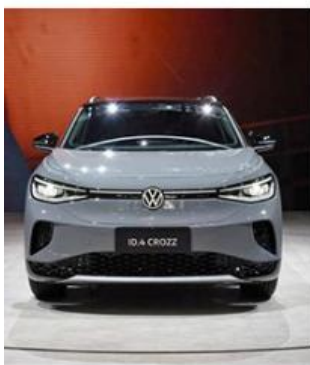
Pure Electric Cars