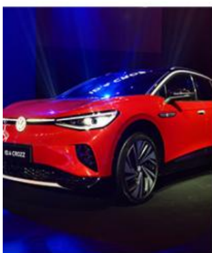
Unique Lamp Group Design