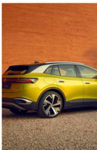
Durable And Stylish Appearance