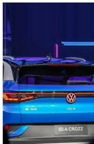
Beautiful Rear End