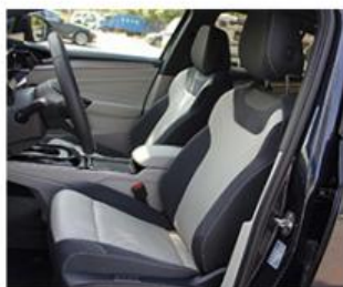
Excellent Overall Space