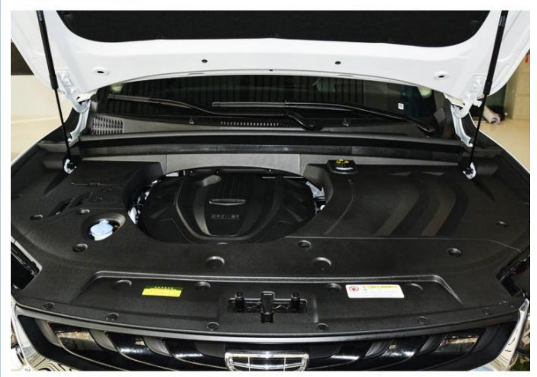
monjaroL get pure electric 82Ps horsepower motor drive, engine backup support, maximum speed of 195km/h, zero hundred acceleration time of 1.6s, electric energy equivalent fuel consumption of 1.8L/100km, good economic performance, which has a better effect on restraining the use cost