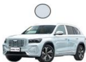
Morning Dew White