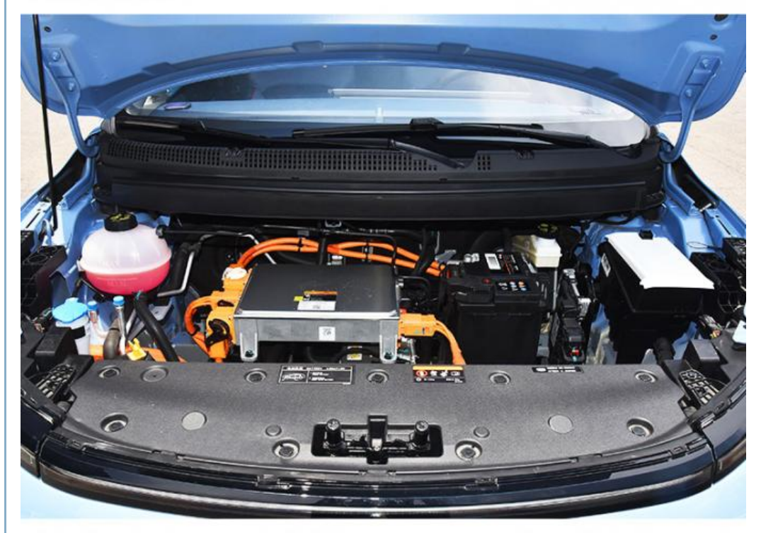
Geely Geometry E get pure electric 82Ps horsepower motor drive, engine backup support, maximum speed of 102km/h, zero hundred acceleration time of 6.9s, electric energy equivalent fuel consumption of 1.3L/100km, good economic performance, which has a better effect on restraining the use cost