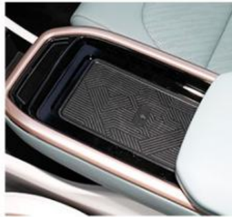
Switch Key Of Economic Mode And Sport Mode