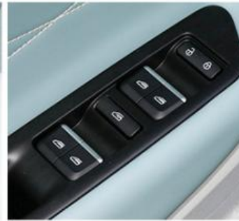
Tire Pressure Monitoring