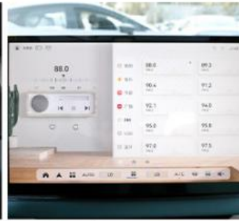
LCD and Reversing Image