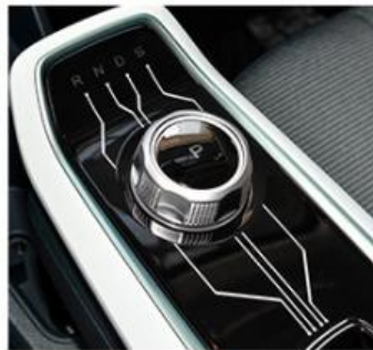
Switch Key Of Economic Mode And Sport Mode