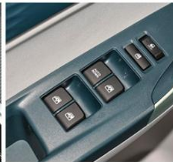
Tire Pressure Monitoring