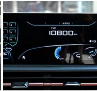
LCD and Reversing Image