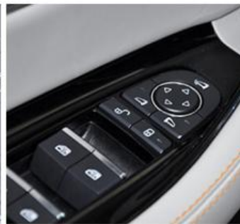
Tire Pressure Monitoring