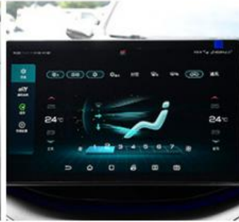
LCD and Reversing Image