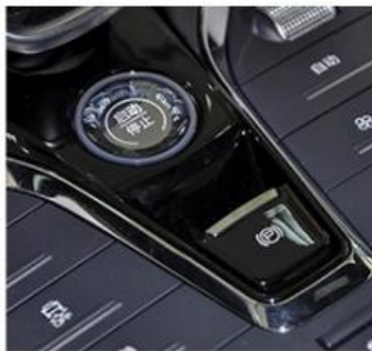
Switch Key Of Economic Mode And Sport Mode