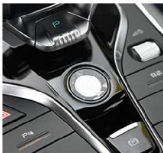
Switch Key Of Economic Mode And Sport Mode