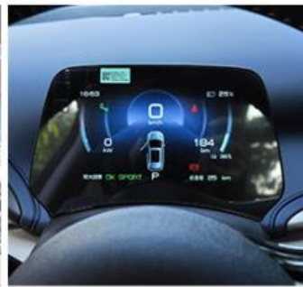
LCD and Reversing Image