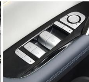
Tire Pressure Monitoring