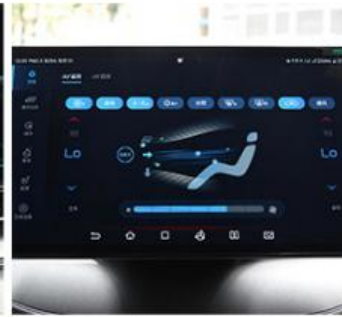
LCD and Reversing Image