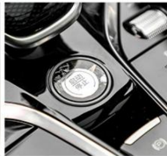
Switch Key Of Economic Mode And Sport Mode