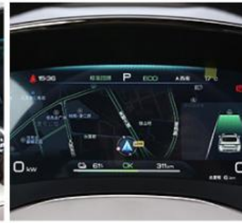
LCD and Reversing Image