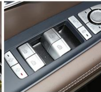
Tire Pressure Monitoring