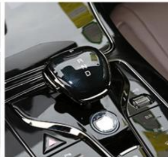
Switch Key Of Economic Mode And Sport Mode