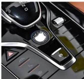
Switch Key Of Economic Mode And Sport Mode