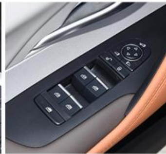
Tire Pressure Monitoring