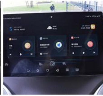
LCD and Reversing Image