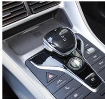
Switch Key Of Economic Mode And Sport Mode