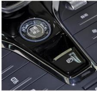
Switch Key Of Economic Mode And Sport Mode