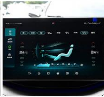
LCD and Reversing Image