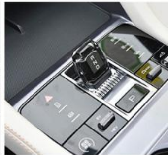
Switch Key Of Economic Mode And Sport Mode