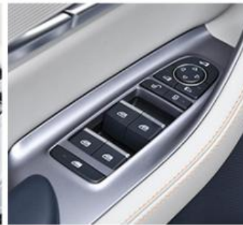
Tire Pressure Monitoring