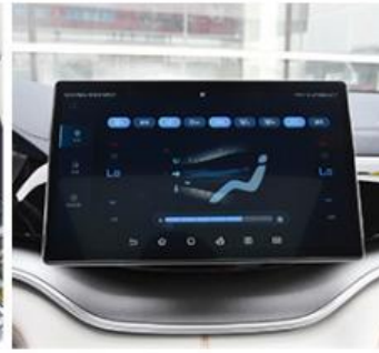
LCD and Reversing Image