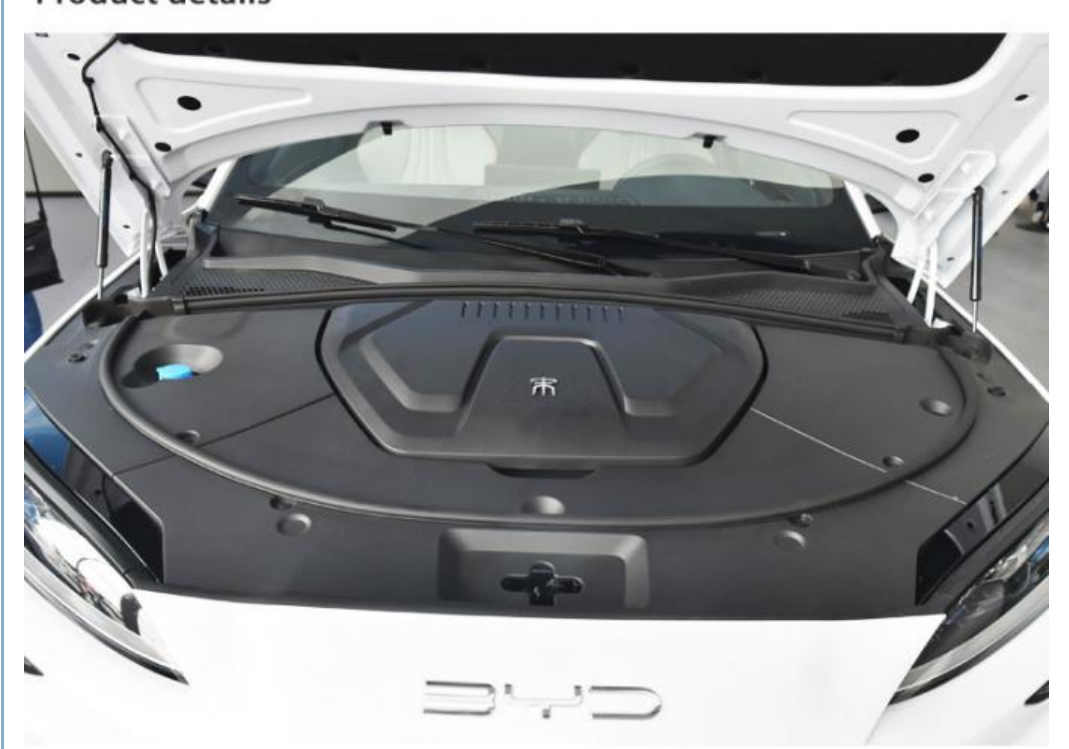
BYD SONG PLUS EV get pure electric 204Ps horsepower motor drive, engine backup support maximum speed of 175km/h, zero hundred acceleration time of 4s, electric energy equivalent fuel consumption of 1.55L/100km, good economic performance, which has a better effect on restraining the use cost