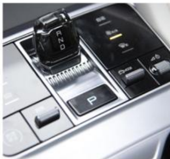
Switch Key Of Economic Mode And Sport Mode