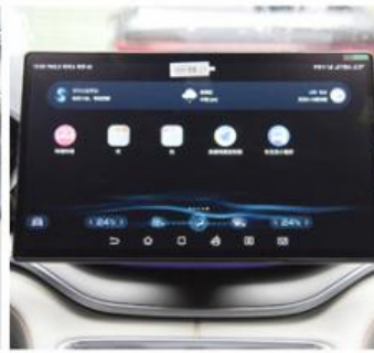
LCD and Reversing Image