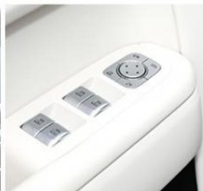
Tire Pressure Monitoring