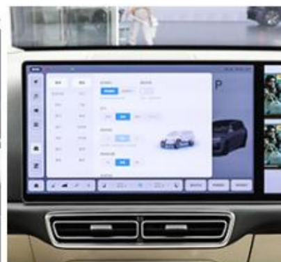
LCD and Reversing Image