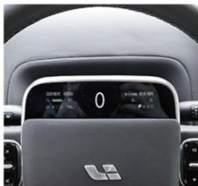
Switch Key Of Economic Mode And Sport Mode