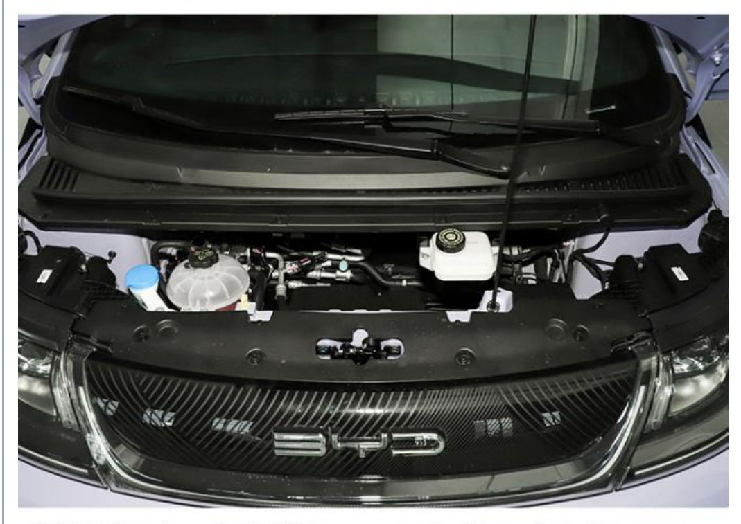
BYD Dolphins get pure electric 95Ps horsepower motor drive, engine backup support, maximum speed of 150km/h, zero hundred acceleration time of 3.9s, electric energy equivalent fuel consumption of 1.2L/100km, good economic performance, which has a better effect on restraining the use cost