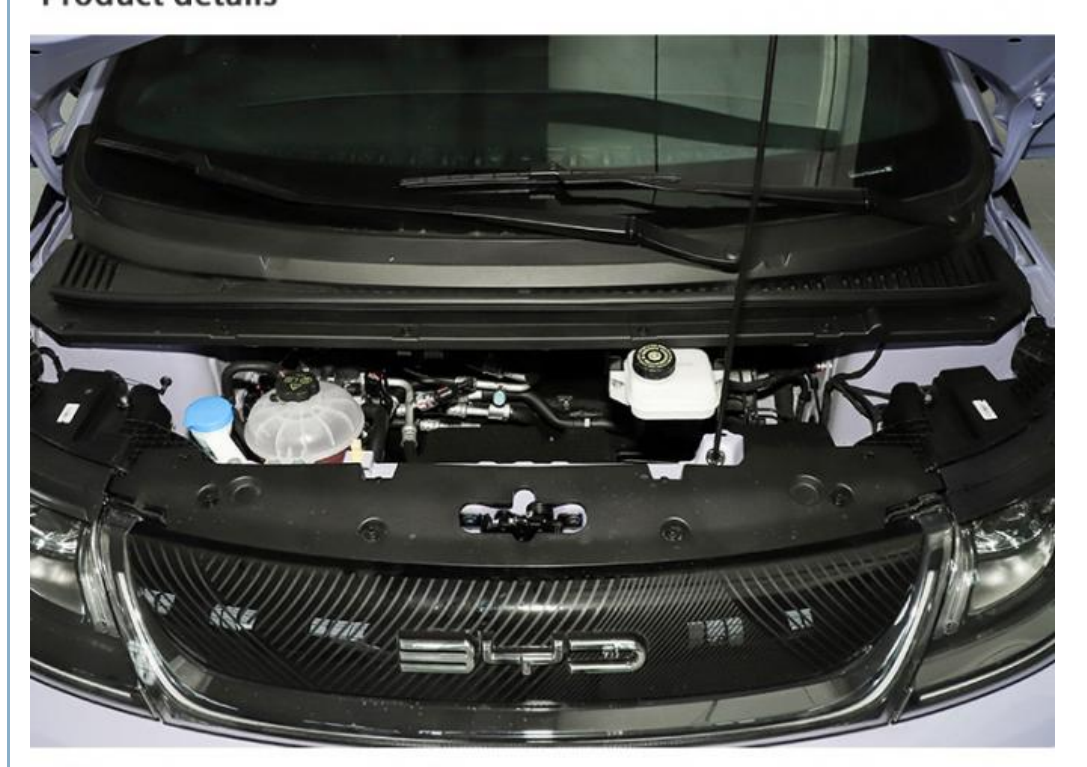
BYD Dolphins get pure electric 95Ps horsepower motor drive, engine backup support, maximum speed of 150km/h, zero hundred acceleration time of 3.9s, electric energy equivalent fuel consumption of 1.2L/100km, good economic performance, which has a better effect on restraining the use cost