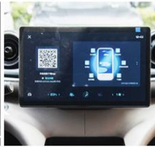
LCD and Reversing Image