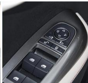
Tire Pressure Monitoring