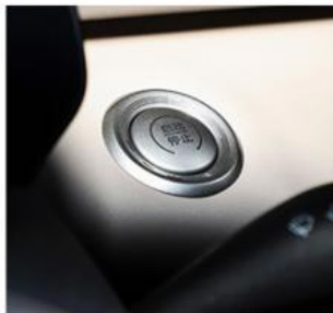
Switch Key Of Economic Mode And Sport Mode