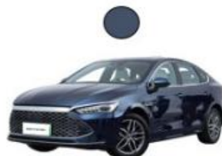
Ink Jade Blue