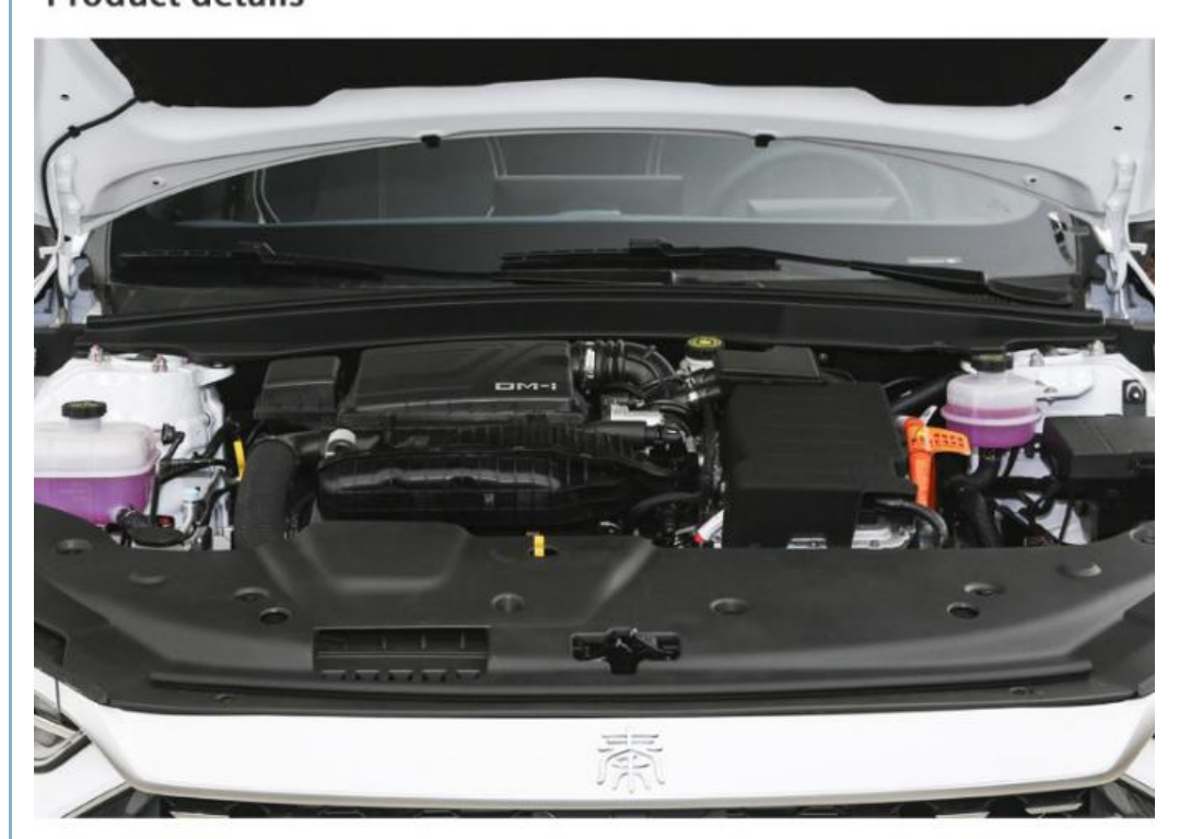
QIN PLUS DM-I get pure electric 180Ps horsepower motor drive, engine backup support, maximum speed of 185km/h, zero hundred acceleration time of 7.9s, electric energy equivalent fuel consumption of 3.8L/100km, good economic performance, which has a better effect on restraining the use cost