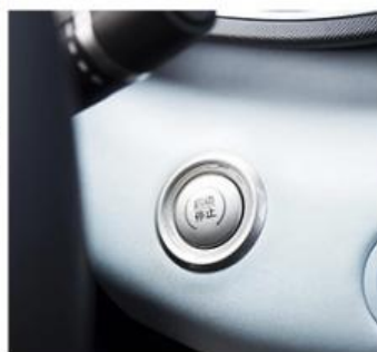
Switch Key Of Economic Mode And Sport Mode