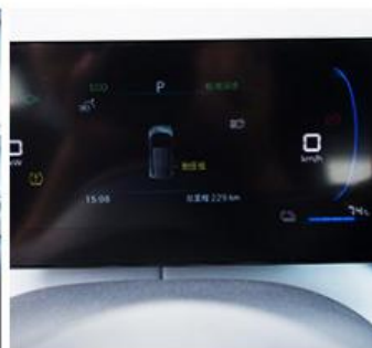
LCD and Reversing Image