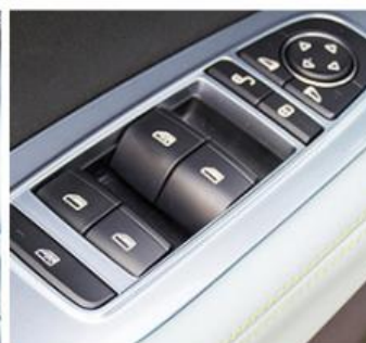
Tire Pressure Monitoring