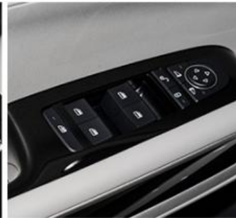
Tire Pressure Monitoring