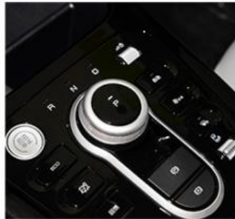
Switch Key Of Economic Mode And Sport Mode