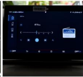
LCD and Reversing Image