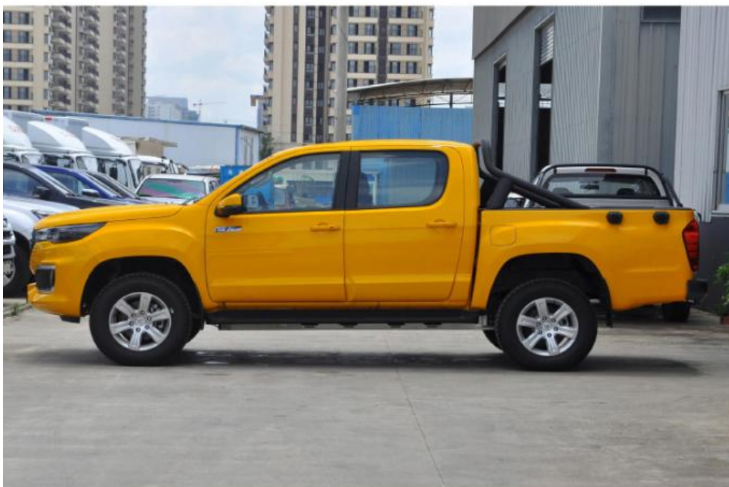
The General EV pickup continues the design style of the fuel version and is also the design

In terms of power, it is equipped with a Blue Whale dedicated turbocharged engine, with a maximum horsepower of 170Ps and a maximum torque of 260\text{N} \cdot \text{m} . With the assistance of an electric motor, the system's comprehensive maximum torque reaches 590\text{N} \cdot \text{m} . It is matched with a 6-speed three clutch electric drive transmission, which takes only 6.5 seconds to break 0-100km/h.