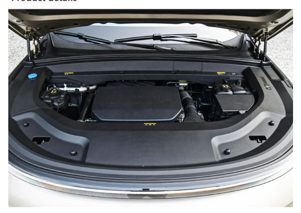
lixiangL8 get pure electric 449Ps horsepower motor drive, engine backup support, maximum speed of 180km/h, zero hundred acceleration time of 5.3s, electric energy equivalent fuel consumption of 2.7L/100km, good economic performance, which has a better effect on restraining the use cost