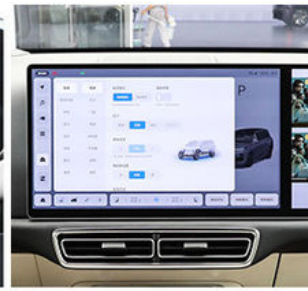
LCD and Reversing Image