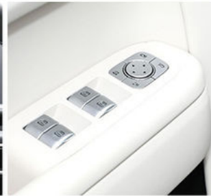
Tire Pressure Monitoring