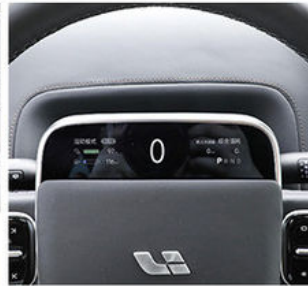
Switch Key Of Economic Mode And Sport Mode