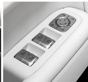
Tire Pressure Monitoring