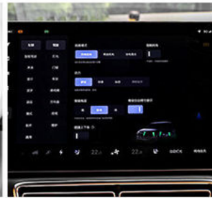
LCD and Reversing Image