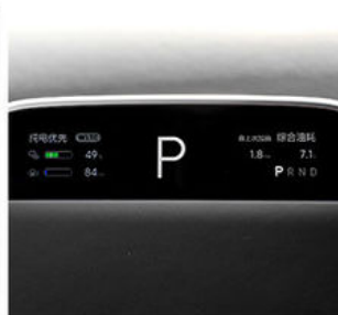
Switch Key Of Economic Mode And Sport Mode