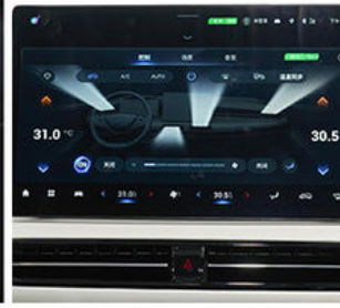
LCD and Reversing Image