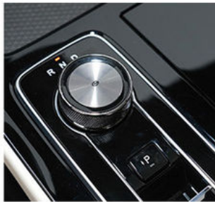
Switch Key Of Economic Mode And Sport Mode