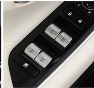
Tire Pressure Monitoring